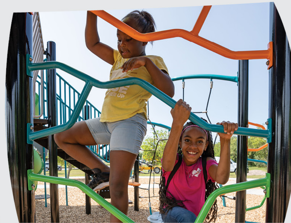
TREE BRANCH CLIMBER