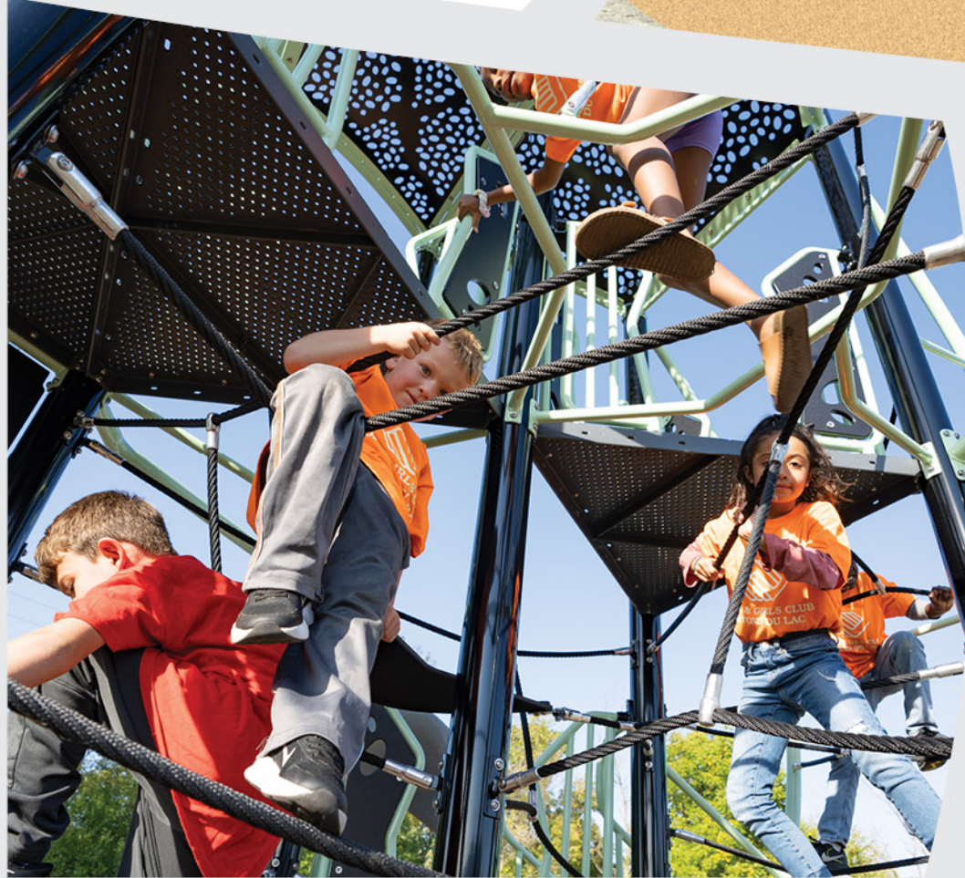
NUCLEUS CORE™ CLIMBER

PLAY ILLINOIS PARK & PLAYGROUND SOLUTIONS