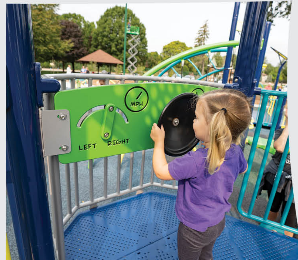
CAR ACCESSIBLE REACH PANEL