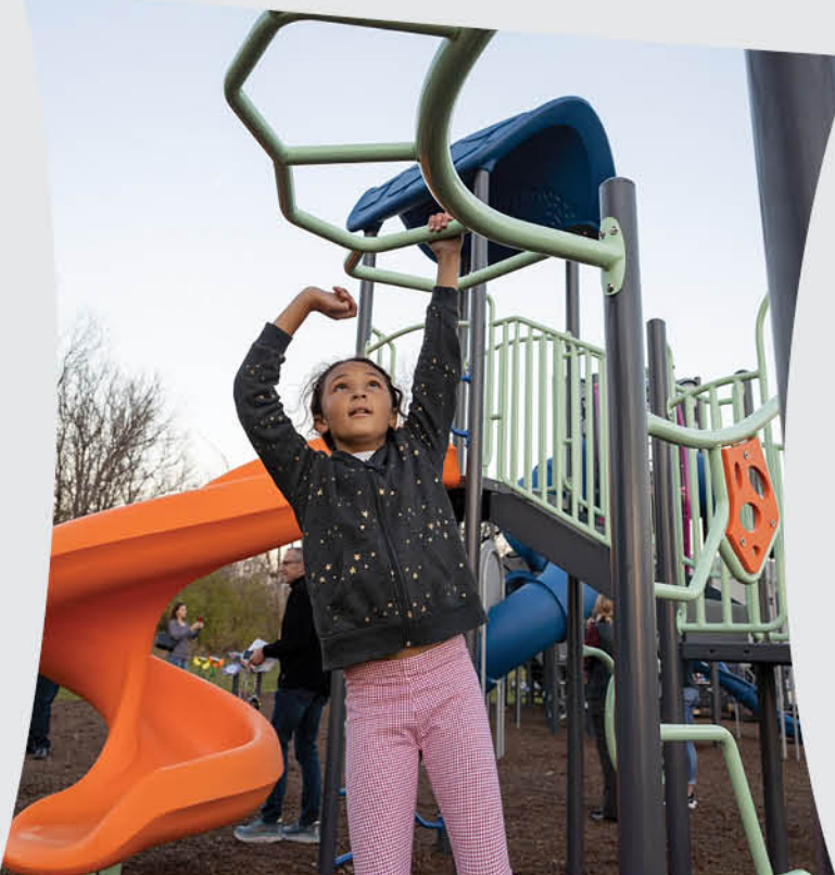
90 DEG HORIZONTAL LADDER