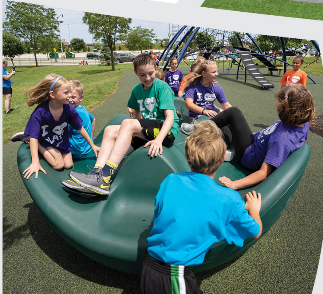
VOLTA INCLUSIVE® SPINNER

PLAY ILLINOIS PARK & PLAYGROUND SOLUTIONS