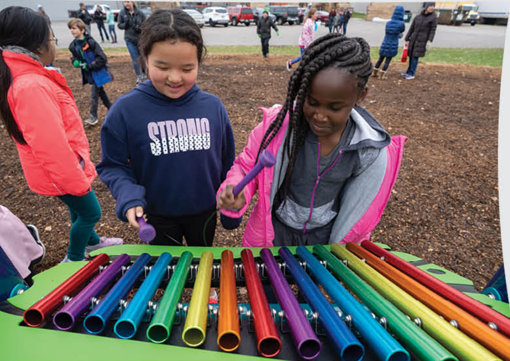
PLAYENSEMBLE® SUPINE CHIMES HUE