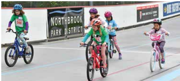
Kids' Duathlon at Ed Rudolph Velodrome in Meadowhill Park