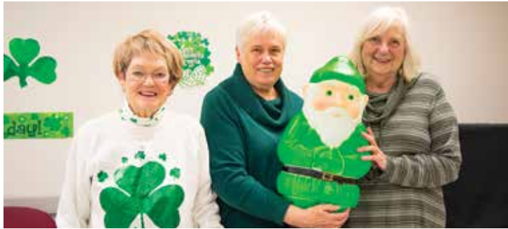
Northbrook Park District Senior Center St. Patrick's Day Party