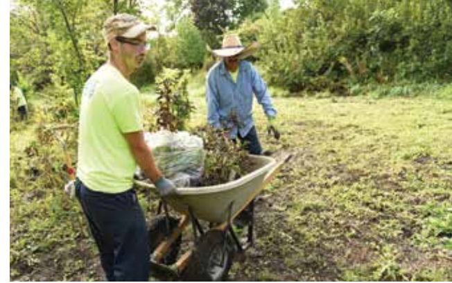
Park District staff relocating peony plants