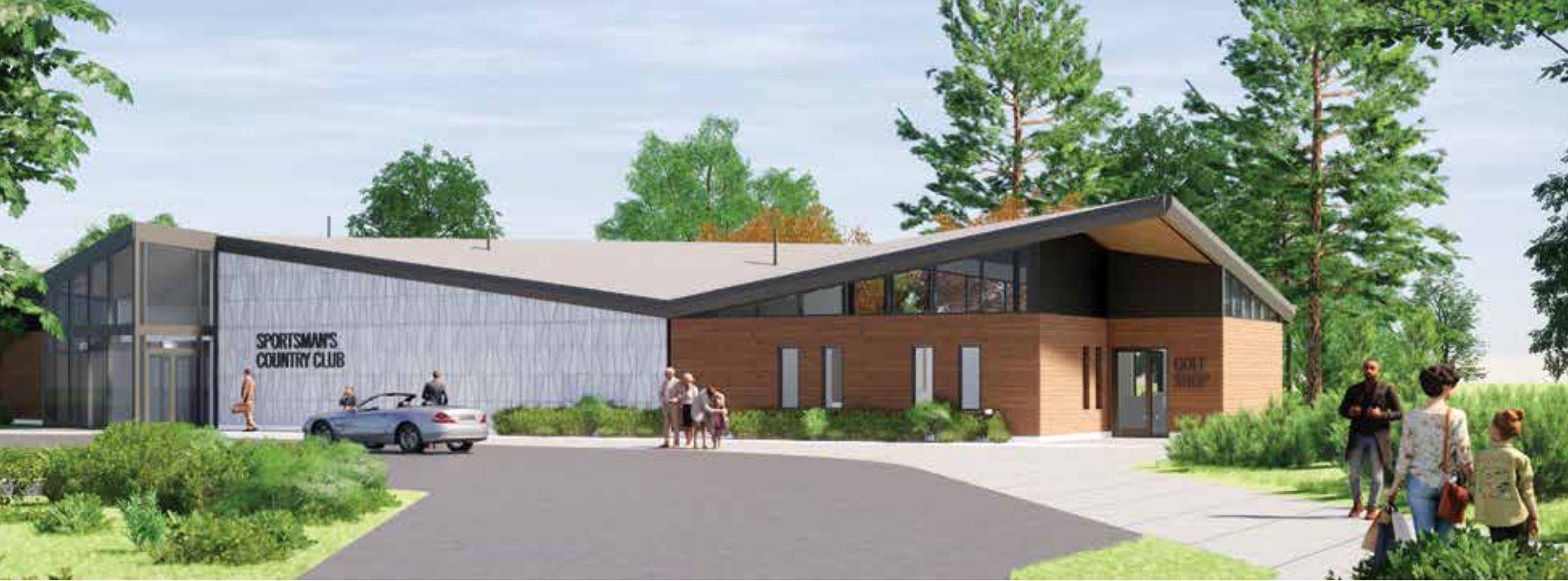
Concept Design for new Clubhouse at Sportsman's Country Club