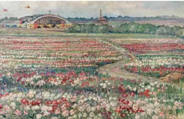
Peony garden at former Northbrook Gardens*