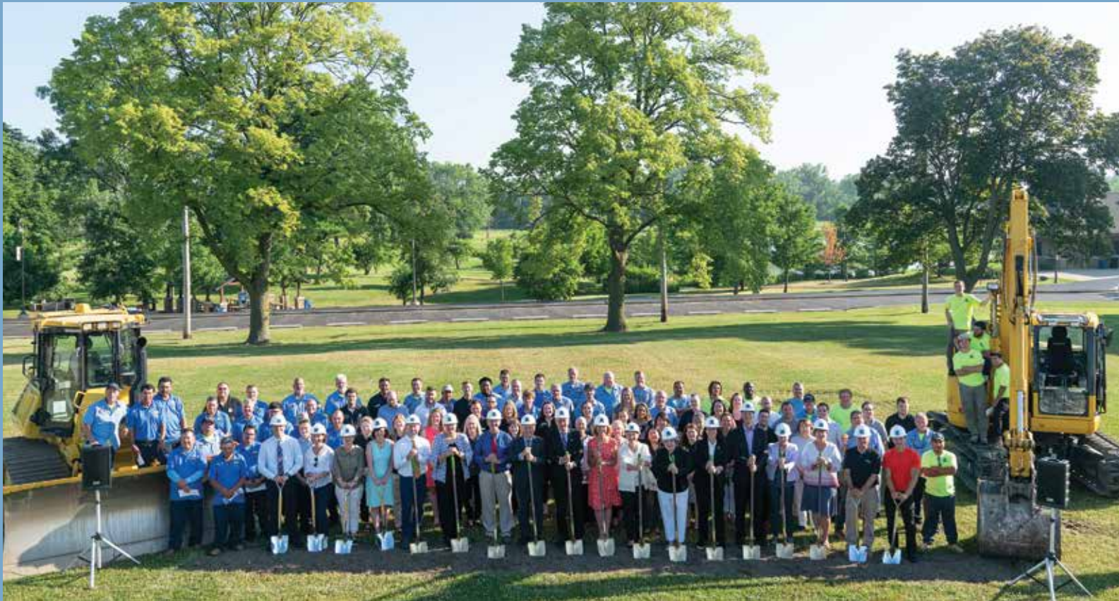
Northbrook Park District Staff and the Park Board of Commissioners at the Groundbreaking celebration for the new Activity Center — July 10, 2019