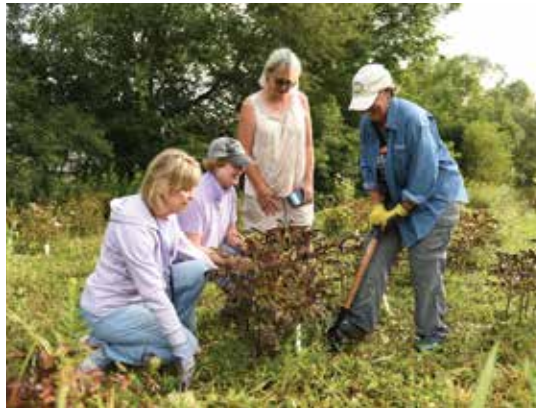
Garden Club members digging out a peony plant