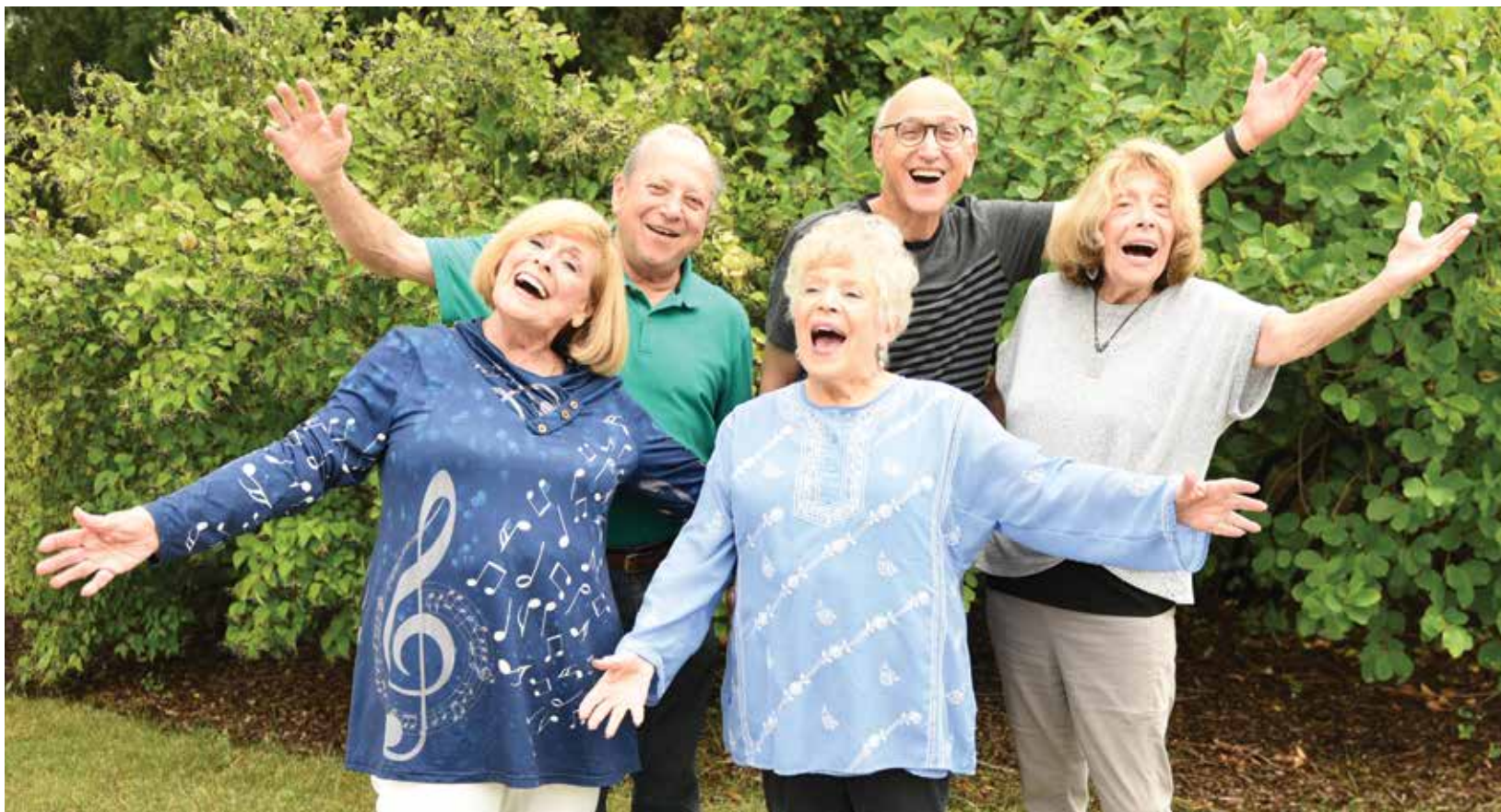
Members from the Senior Center Park Larks group spread cheer throughout Northbrook

Residential Customer Northbrook, IL 60062