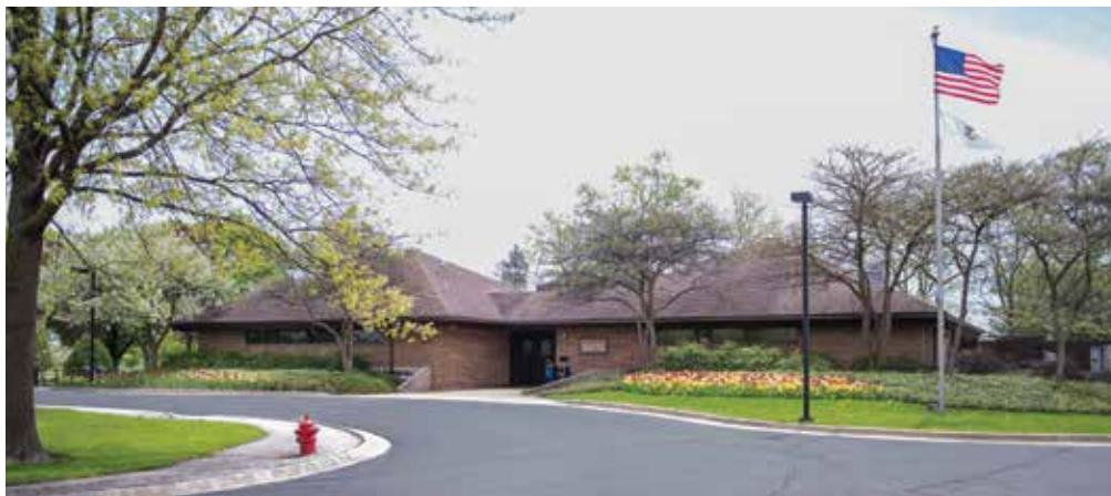
Sportsman's Clubhouse 2019