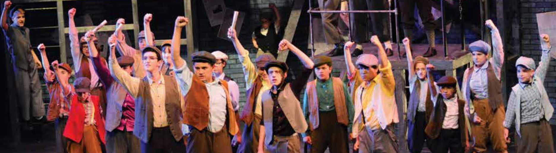
The Northbrook Theatre Community Musical Cast from the spring 2019 production of Newsies