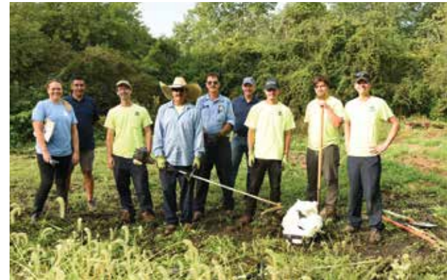
Park District staff posing for a group photo