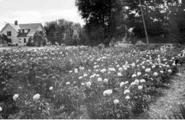
Peony garden at the Christman home*