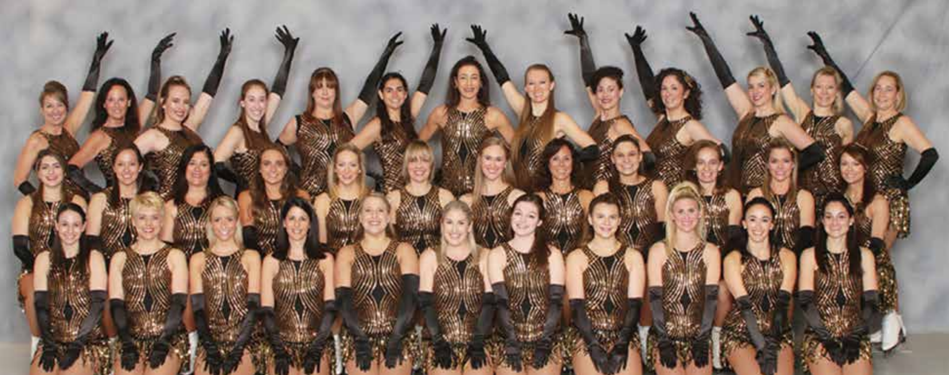
Icette alumni representing 1969-2018