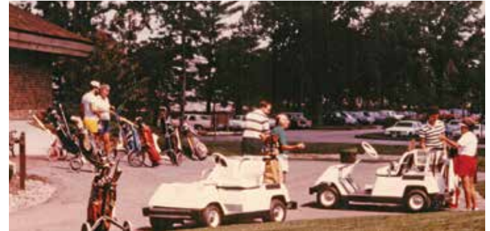
Sportsman's cars and Clubhouse circa 1980s