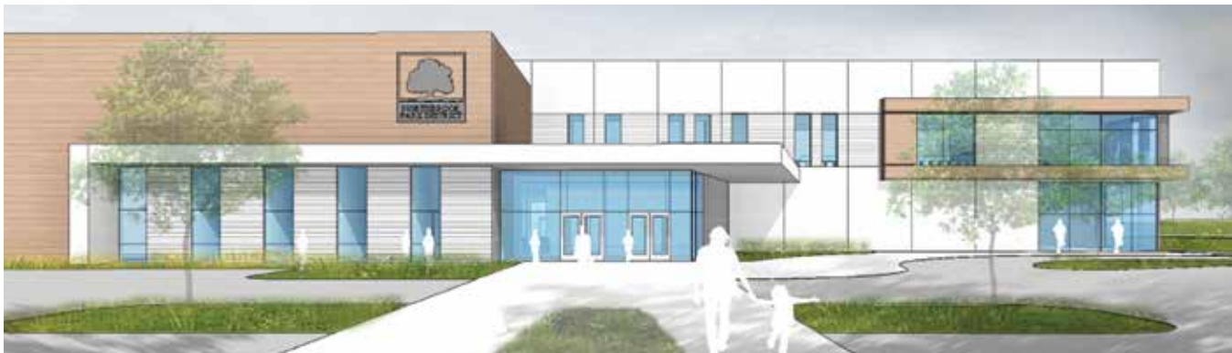
Concept Design for the new Activity Center at Techny Prairie Park and Fields

Construction is progressing for the Northbrook Park District's new Activity Center at Techny Prairie Park and Fields—an extraordinary space promoting health, wellness and fitness. The Northbrook Park District is receiving a $1.78 million grant from Illinois Clean Energy Community Foundation which will fund construction and materials to achieve the Net Zero Energy building status. Net Zero Energy buildings offset their own energy consumption by generating required energy on-site from renewable resources. The new Activity Center's innovative plans by Chicago-based architects Wight & Company exceed state and national sustainability standards and are part of the District's ongoing commitment to enhancing the community's green spaces now and for future generations.