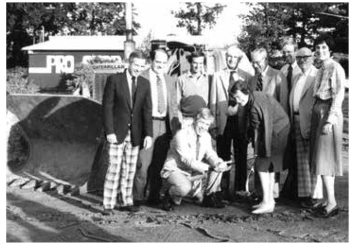
Groundbreaking for Clubhouse 1982