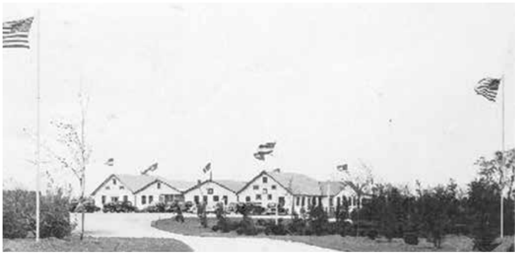
Sportsman's Clubhouse 1942