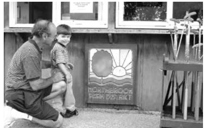
Mini Golf circa late 1980s