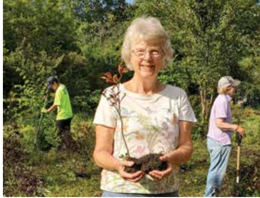
Garden Club member holding a peony plant