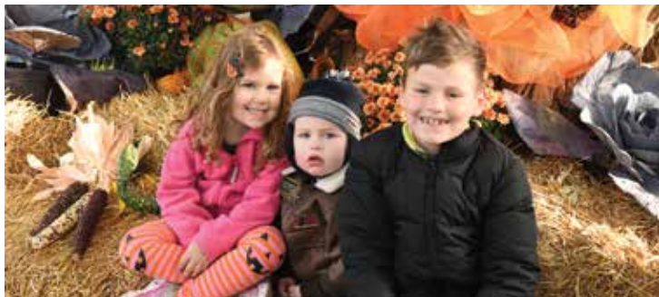
Northbrook Autumnfest at Meadowhill Park