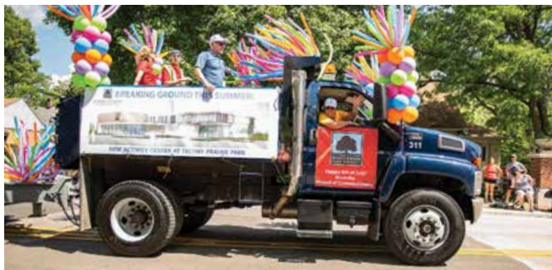
Northbrook Park District colorfully announced the new Activity Center's Groundbreaking at the 4th of July Parade