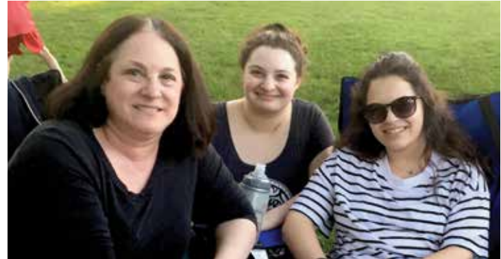
Tuesdays in the Park at Village Green Park