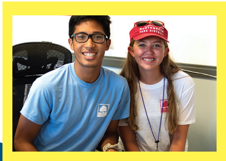
Lifeguards & Pool Attendants

To complete an application visit nbparks.org/jobs