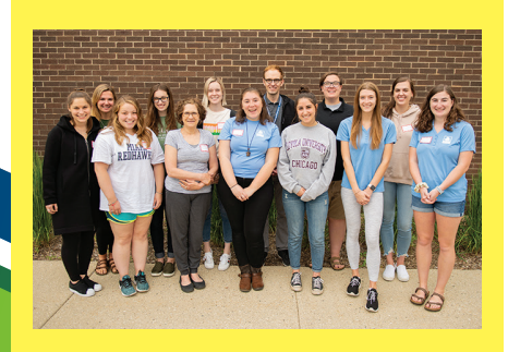
Camp Site Directors