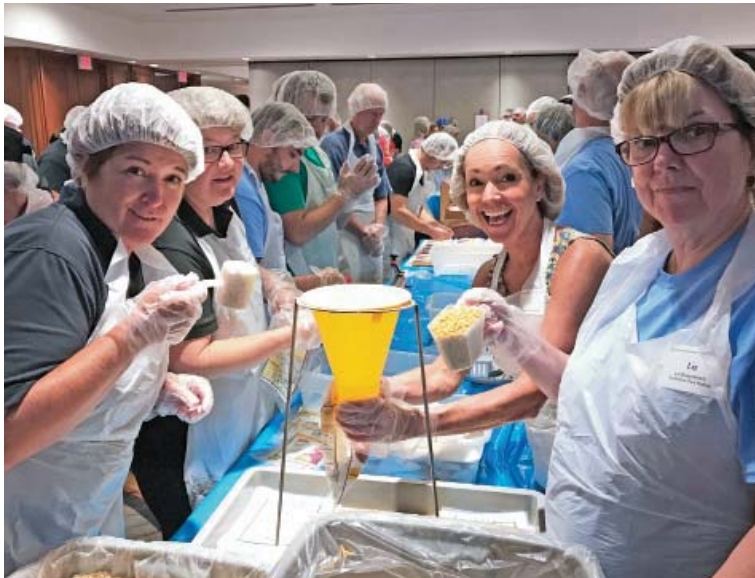
Great things happen when we all come together – District staff packing meals at Chamber event