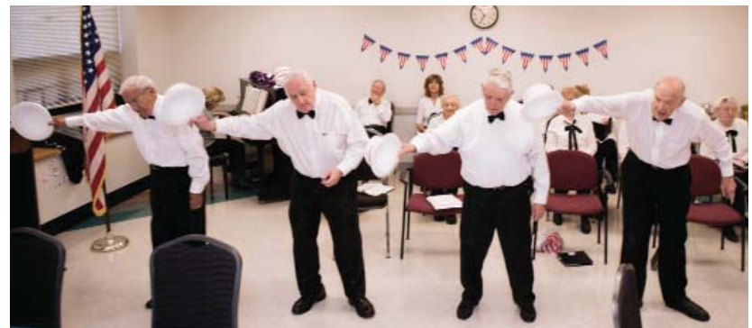
Second-to-none singing troupe, the Senior Center's Park Larks, entertaining all year long