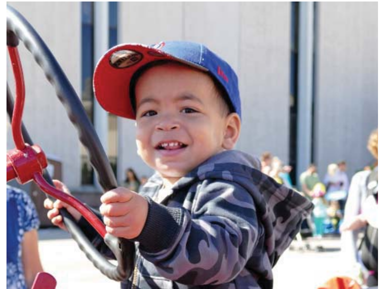
Touch-A-Truck at UL – making big impressions on our littlest residents