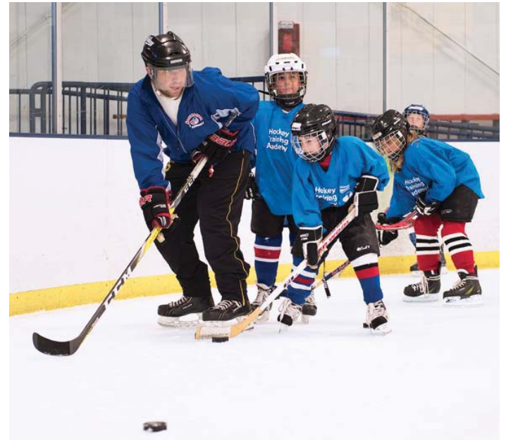
Photos (L-R, Top-Bottom): Yoga, Safety Town, STEM Challenge, Northbrook After Dark, Hockey Training Academy