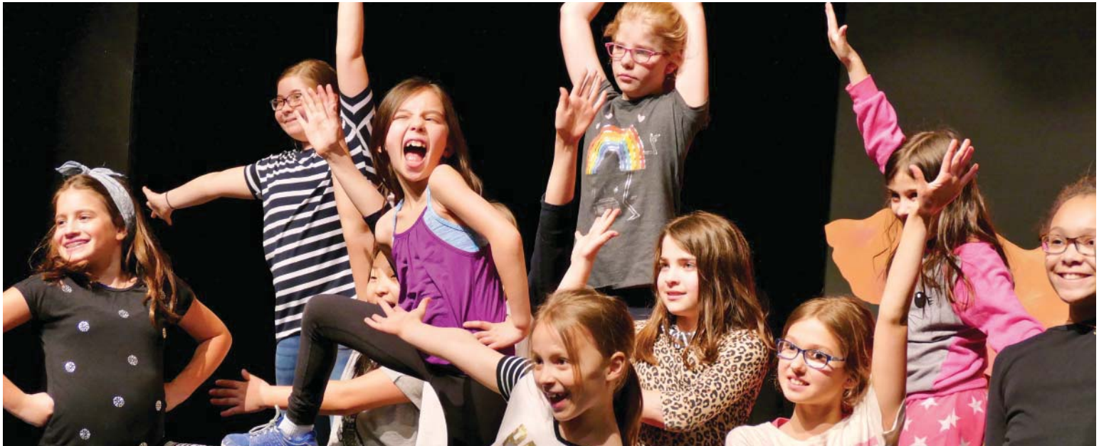
Northbrook Theatre Summer Workshop – celebrating kids’ creativity & expression