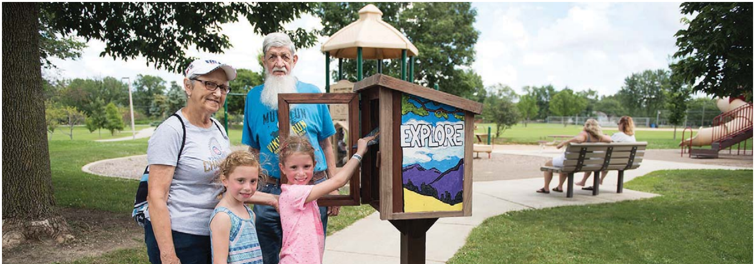
Reading lets the imagination soar – the Little Library at Wood Oaks Green Park