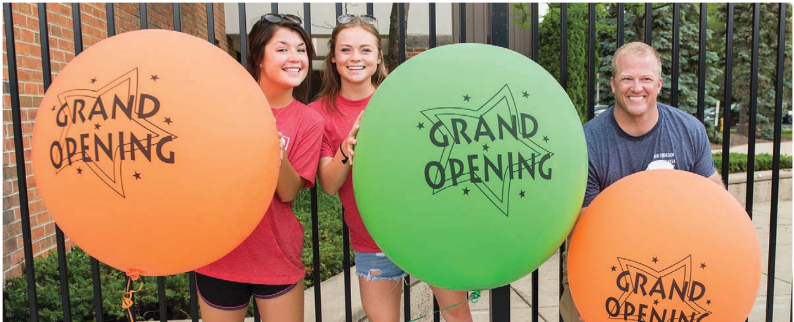
With a water walk, vortex pool & more, the Northbrook Sports Center Pool is really making a splash with residents