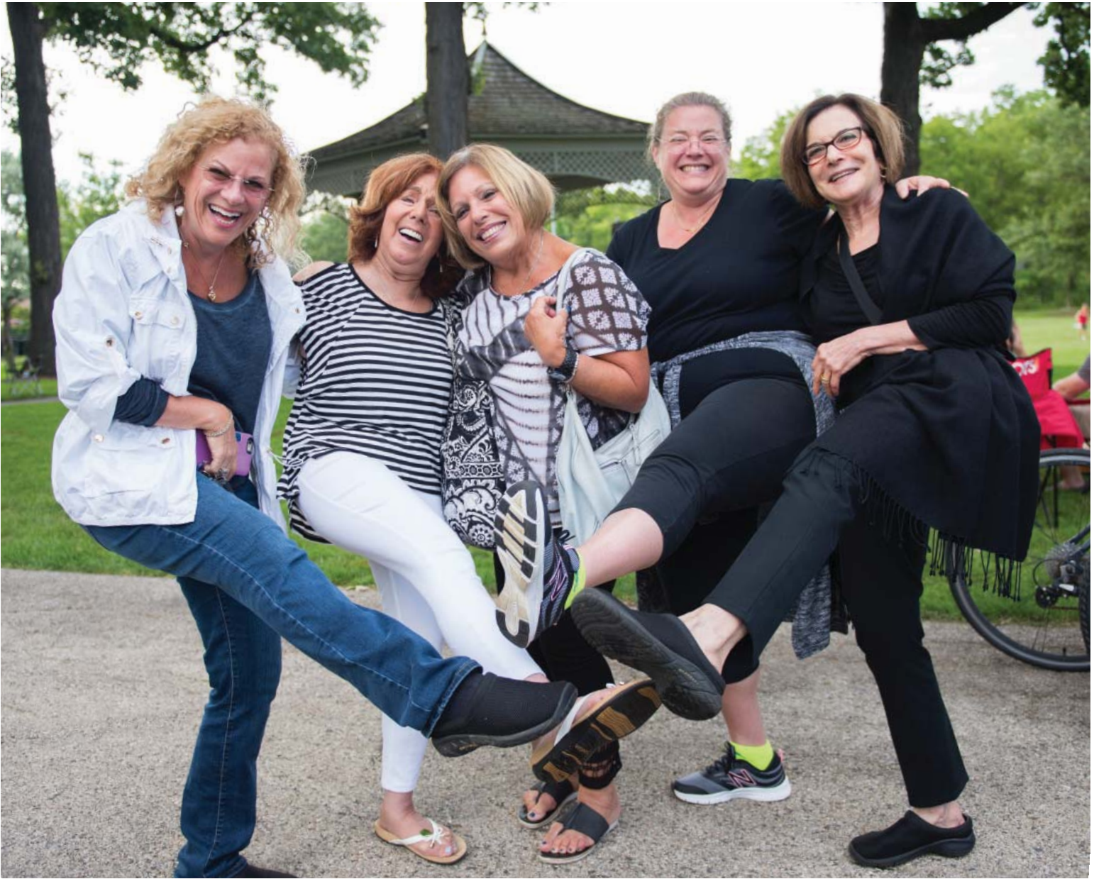
Tuesdays in the Park concert series draw hundreds to Village Green Park through June & July