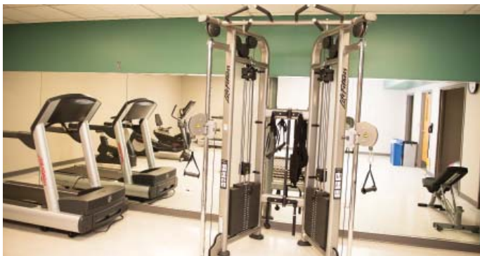
Get fit at the Leisure Center's new fitness room – The Ridge