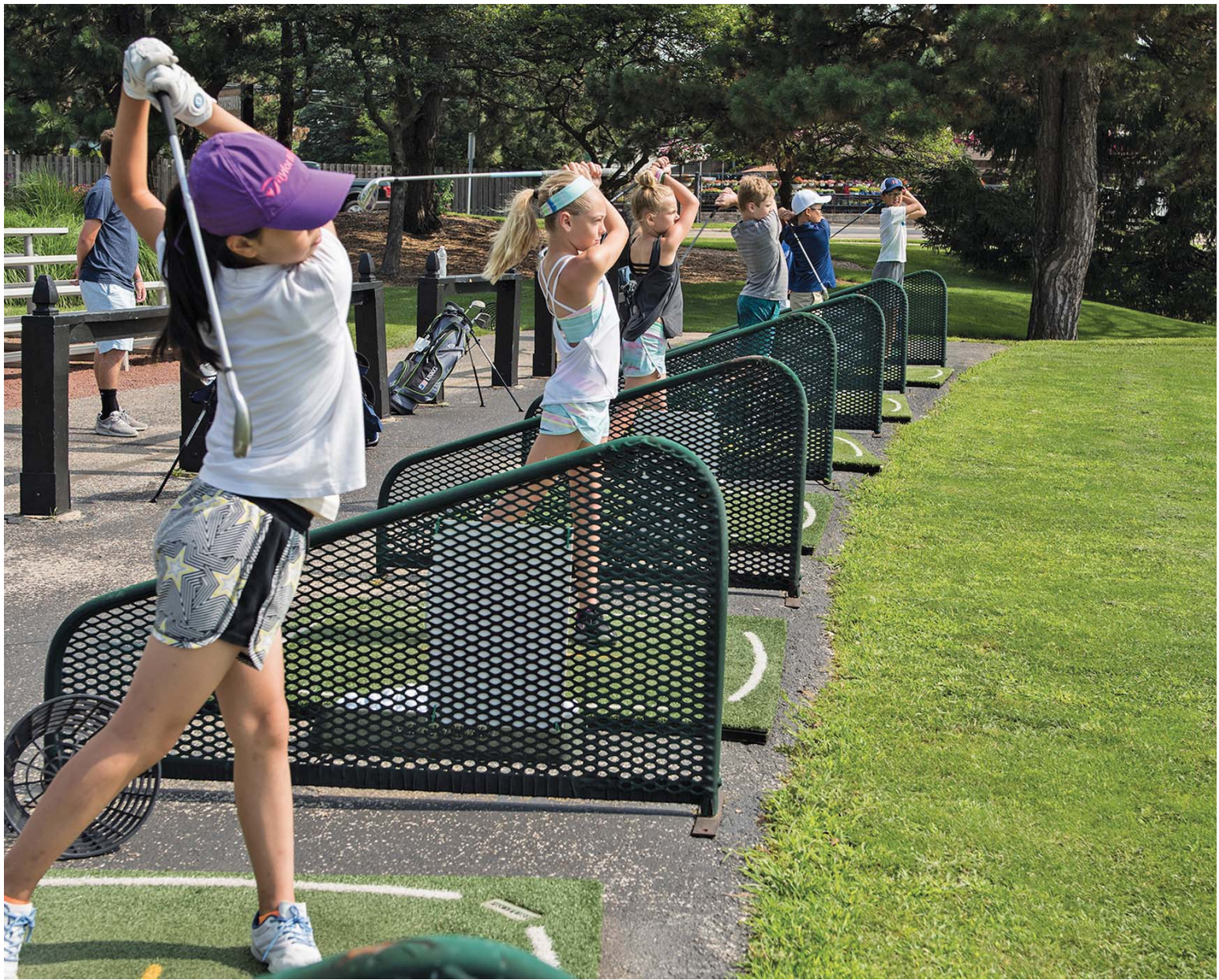
Northbrook Golf Academy – our youth golf program like no other