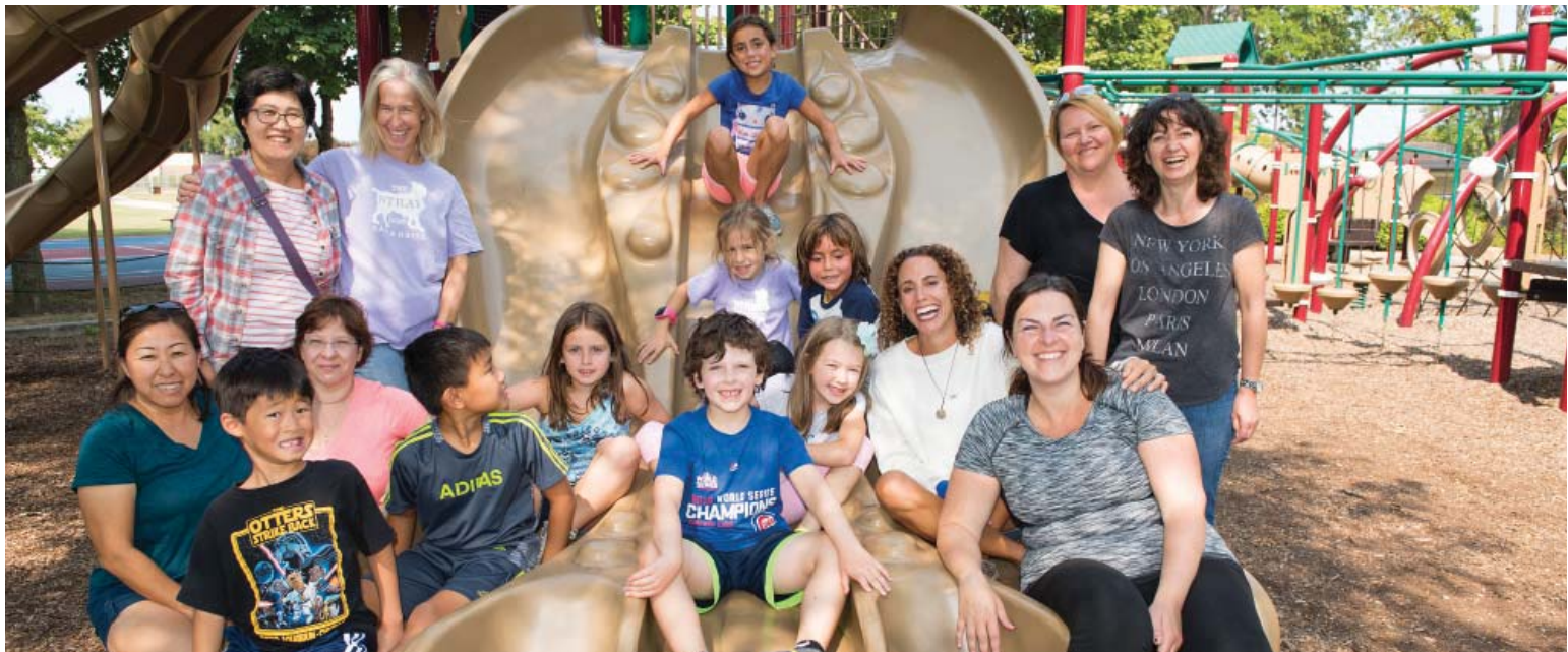
Sunshine Preschool friends reconnect at Indian Ridge Park