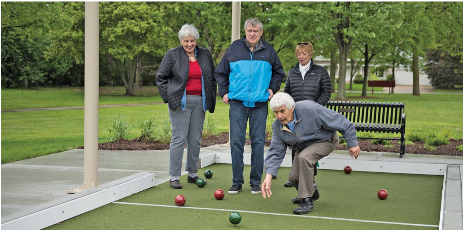
Indian Ridge Park's new Bocce Ball Courts – fun for all ages