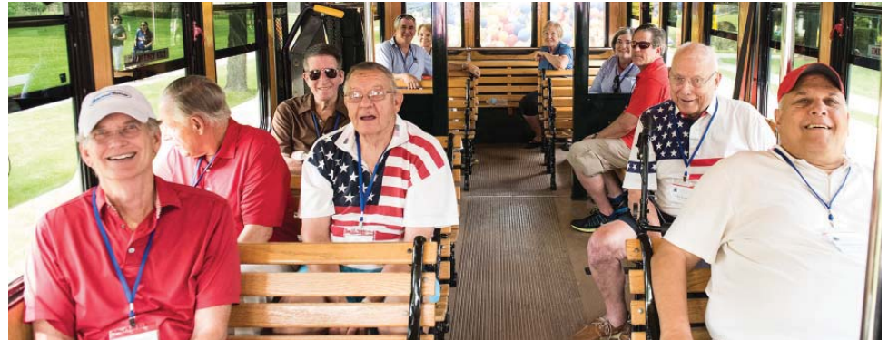
Former & current Commissioners represented the District as the 2017 4th of July Parade Marshals – Celebrating our 90th Anniversary.

For the 24th consecutive year, the District received a Certificate of Achievement for Excellence in Financial Reporting from the GFOA for its Comprehensive Annual Financial Report (CAFR). This is the highest form of recognition in governmental accounting and financial reporting.